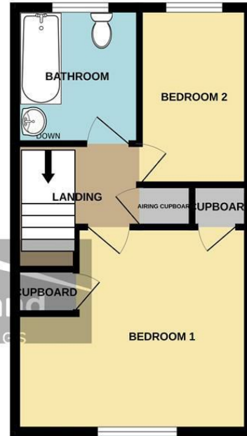
1ST FLOOR 291 sq.ft. (27.0 sq.m.) approx.